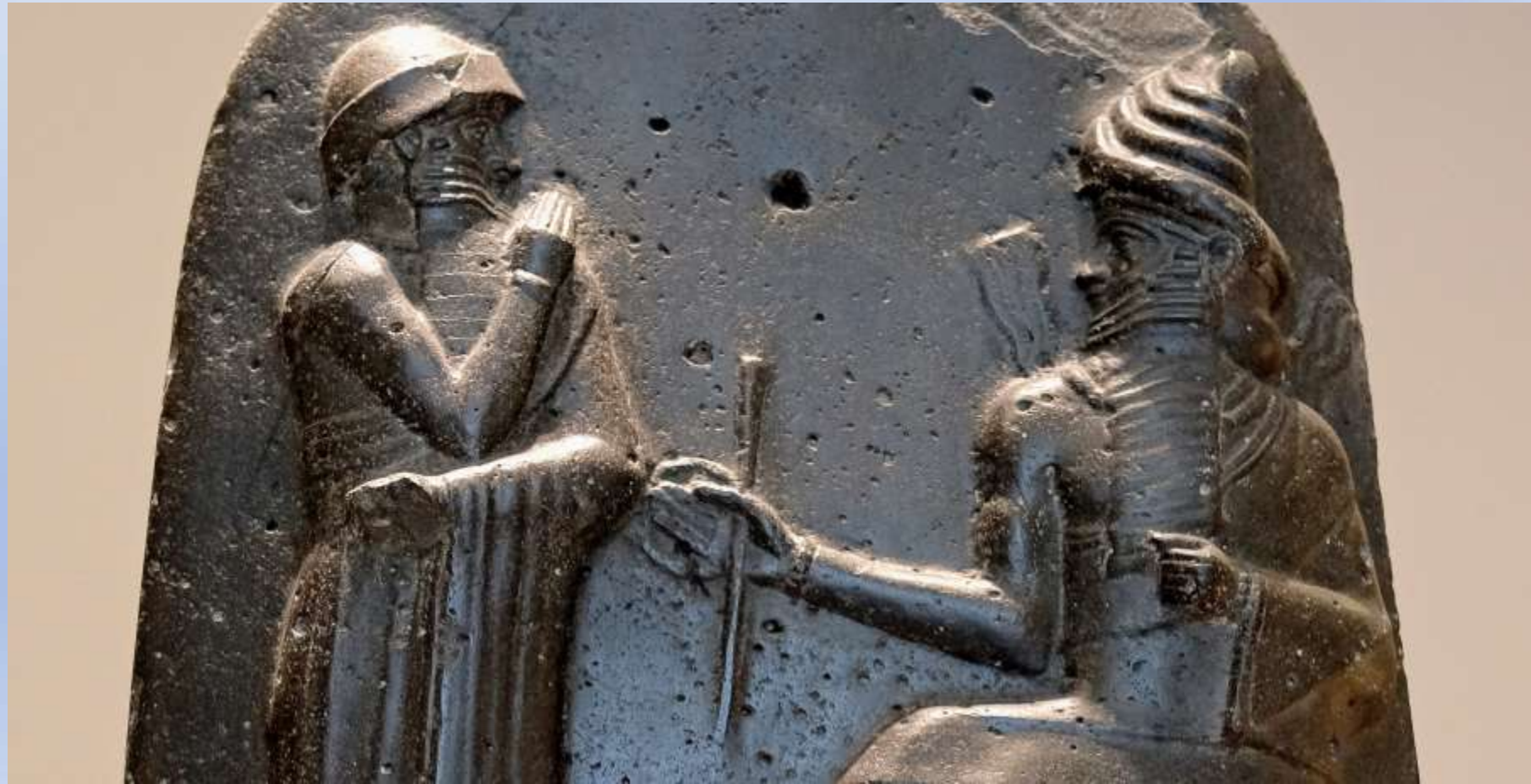
Depicted on top of the stele of his famous law code, Hammurabi stands before a seated Marduk.

1:1 In the third year of the reign of Jehoiakim king of Judah, Nebuchadnezzar king of Babylon came to Jerusalem and besieged it. 2 The Lord gave Jehoiakim king of Judah into his hand, along with some of the vessels of the house of God; and he brought them to the land of Shinar, to the house of his god, and he brought the vessels into the treasury of his god.