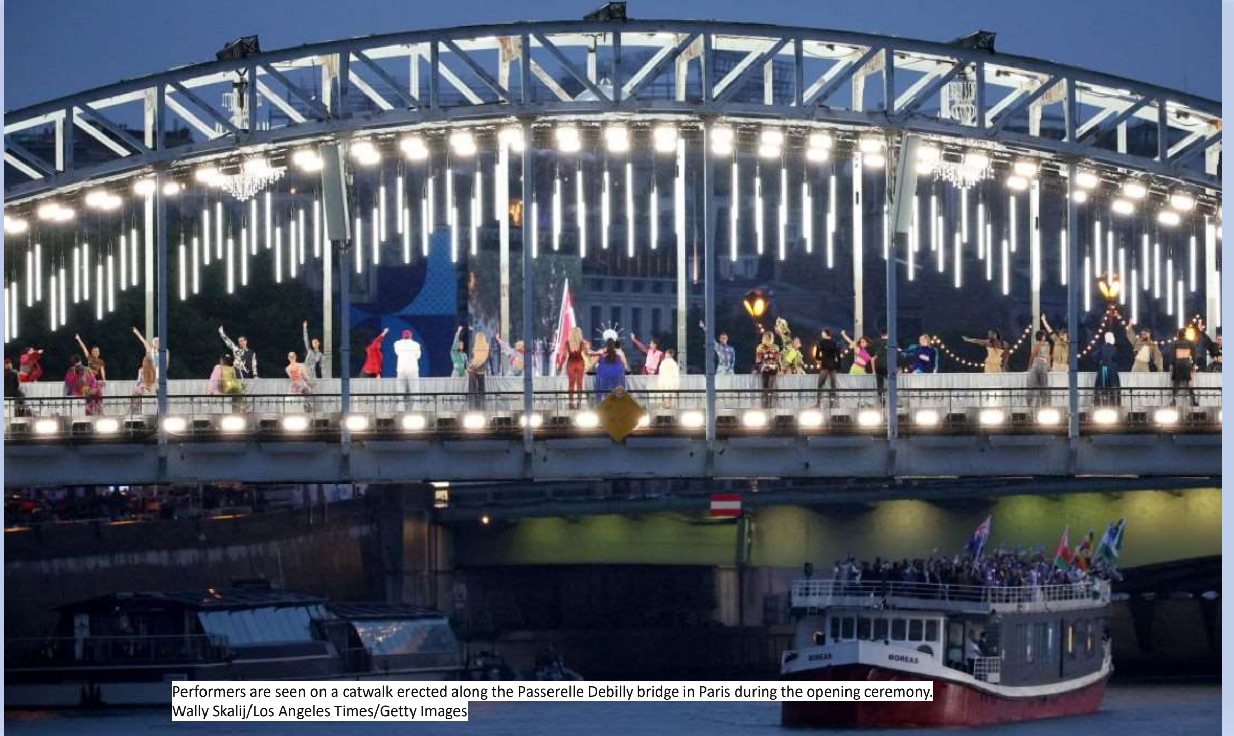
Performers are seen on a catwalk erected along the Passerelle Debilly bridge in Paris during the opening ceremony.