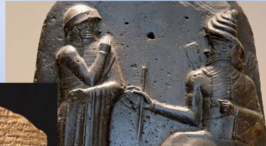
Depicted on top of the stele of his famous law code, Hammurabi stands before a seated Marduk. Hammurabi , CC BY 3.0 , via Wikimedia Commons